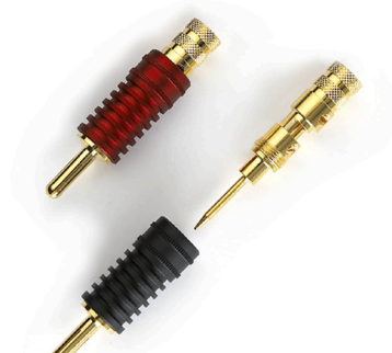
[ WT-LMB ]