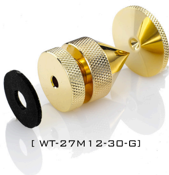
[ WT-27M12-30-G ]