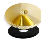
[ WT-C-30-5-G ]