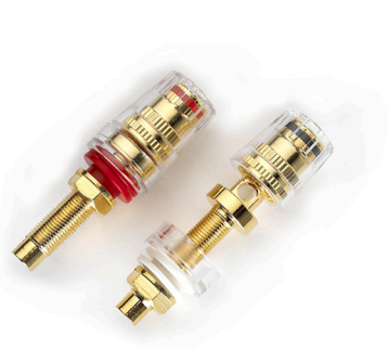
[ WT-FB-1960-G ]