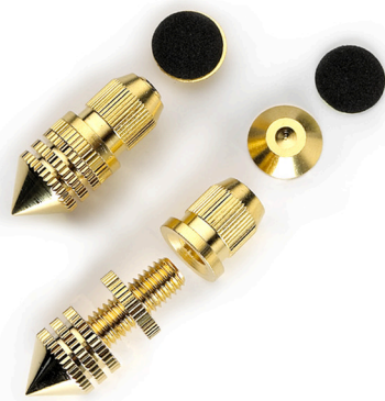
[ WT-15MB-32-G ]