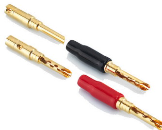
[ WT-MB-1053-G ]