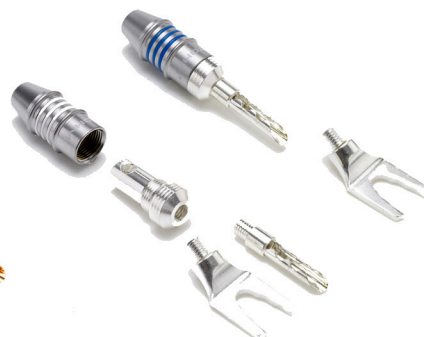
[ WT-STU-SET ]